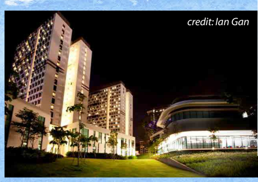
NUS University Town

The actual amounts will depend on your personal needs and lifestyle. Please note that the figures only include expenses for your daily essentials and does not account for other items such as shopping, entertainment, computers, electronic/communication devices, recreational travel, etc.