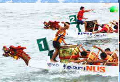
NUS Inter-varsity Dragon Boat Race