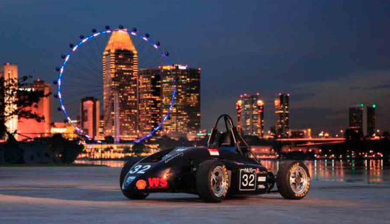
FSAE car designed & built by NUS Engineering students